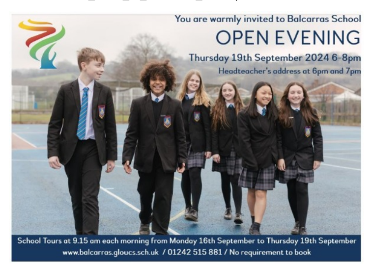
Balcarras School - Open Week 2024

https://holychurchgloucestershire.schoolzineplus.co.uk/_file/media/747/dk_letter_of_invitation_2024.pdf